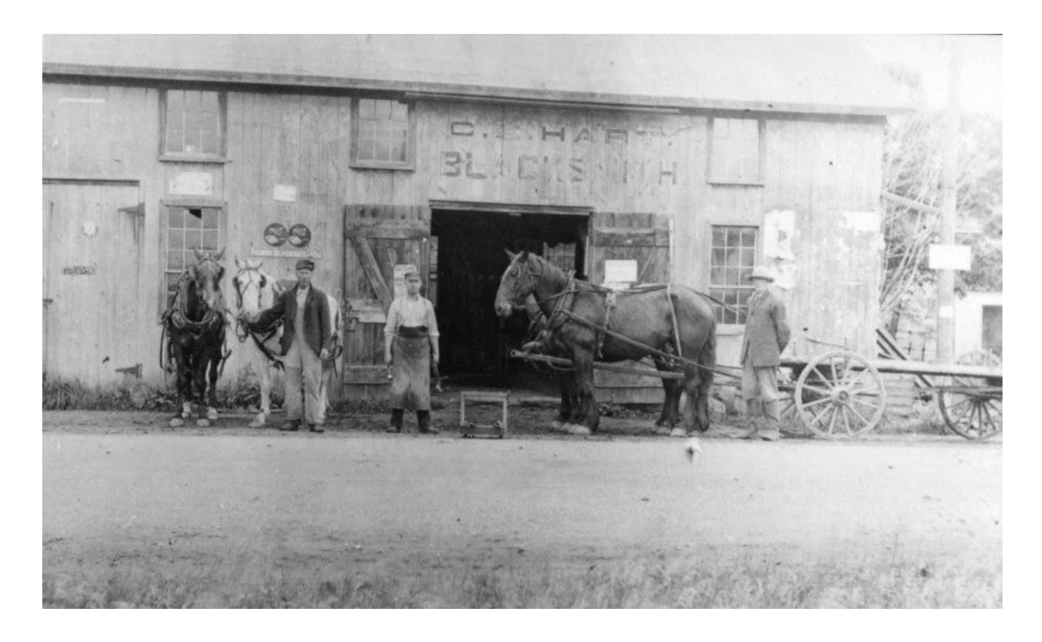
Hart's Blacksmith Shop, Sterling Valley