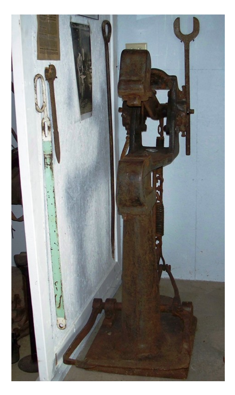
Treadle Hammer in place in the blacksmith shop, Sterling